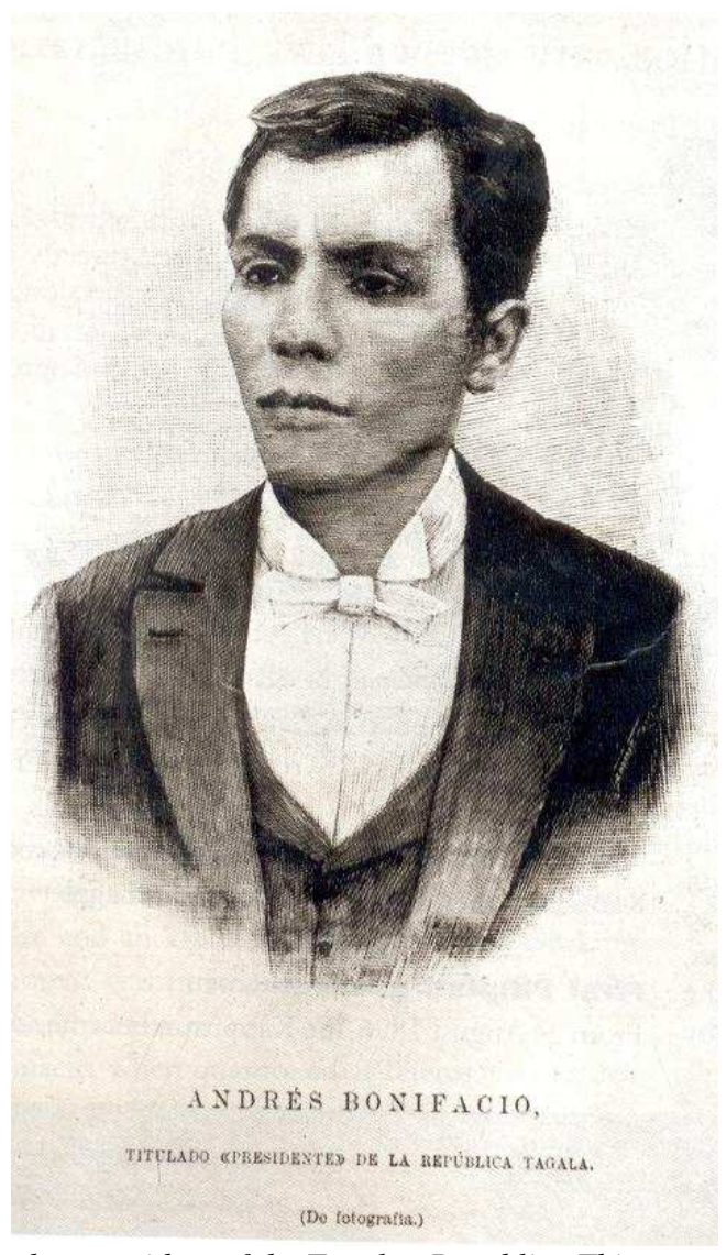
Andres Bonifacio, cited as president of the Tagalog Republic. This engraving accompanied an article on the Philippine Revolution in the La Ilustracion Española y Americana, 8 February 1897. The journal referred to Aguinaldo as a generalissimo, not the head of government. Bonifacio had 60,000 troops at his command, 20,000 of them armed.